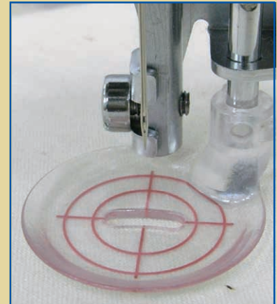
Clear view foot

For uneven surfaces and evenly spaced quilting