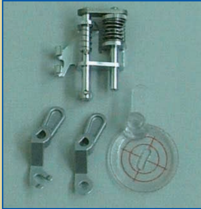
Convertible Free Motion Quilting Foot Set for Memory Craft Embroidery Machines and High Shank Models Part No.: 202001003 (Blister package)

Have you been waiting long? The Free Motion Quilting Foot has been enhanced and will be available in both low shank and high shank versions.