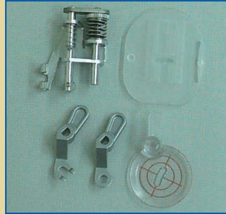
Convertible Free Motion Quilting Foot Set for Low Shank Horizontal Rotary Hook Models Part No.: 202002004 (Blister package) Note: Low shank version comes with quilting plate.