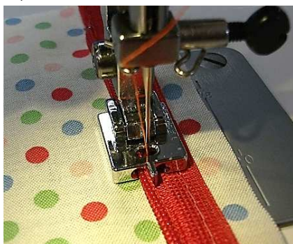
Sew the zipper tape and the fabric using the left groove