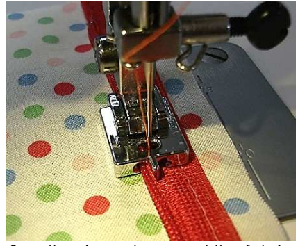
Sew the zipper tape and the fabric using the left groove

Once fitted, a well sewn CONCEAL® zipper will hide its open-parts.