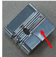
Back side of the foot

There are two grooves on the back side with the left one shorter than the right one. The foot is therefore suitable for curve sewing as well.